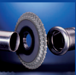
Square, burr-free and deformation-free pipe end – ideal for press fitting applications!