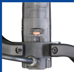
Powerful drive with overload protection and ergonomically designed motor handle.