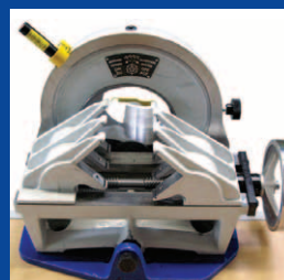
Hardened cast iron clamping jaws – stainless steel caps optional available.