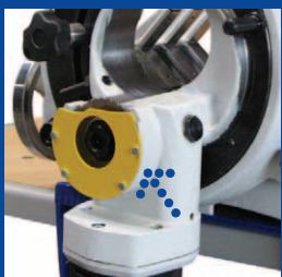
Second saw blade position to cut off elbows.