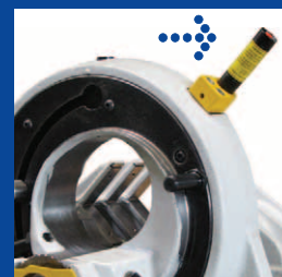
Integrated laser pointer to mark the cut off point.