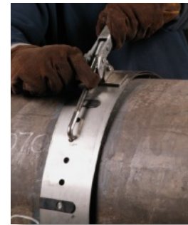
Adjusting Chain Links for Various Diameters