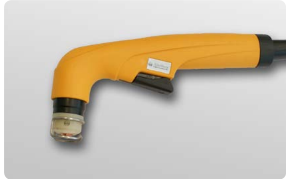
Plasma hand torch KjellCut 70 with ergonomic handle design

The plasma hand torch KjellCut 70 is used for cutting manually with the CutFire 65i.