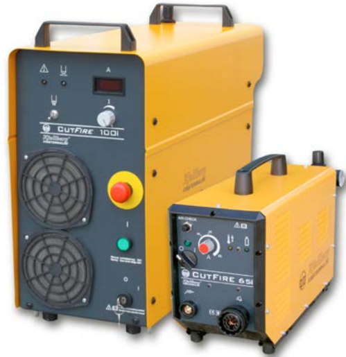
CutFire 100i, CutFire 65i

The powerful and cost-efficient inverters can be used flexibly especially in heating, ventilation and pipeline engineering. Therefore the CutFire 65i and CutFire 100i can easily be adapted to CNC-guided and mechanical guiding systems.