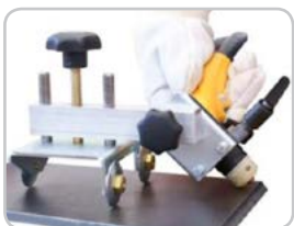
Bevel cutting device