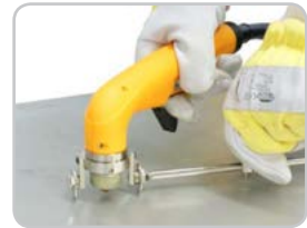
Circle cutting device