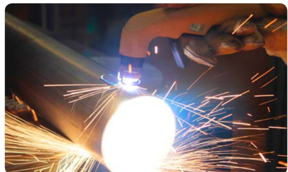
Manual plasma cutting of pipes