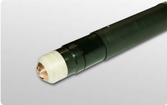
Machine torch Flash 100 with 6 or 12 m hose parcel available

The air-cooled plasma machine torch Flash 100 is used for mechanised plasma cutting with the inverters of the CutFire series. The torch is equipped with a central connector for a quick torch change.